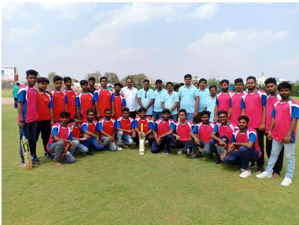
Cricket Winning Team in Intercollege sports competition 2018 – 19