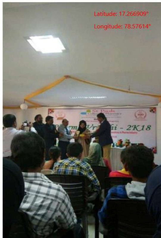
Best Poster award at Pharma Vridhi 2K18