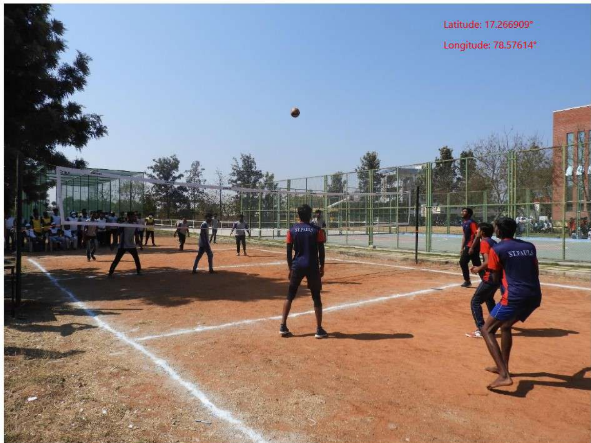
Volley ball team in inter college Sports Competitions