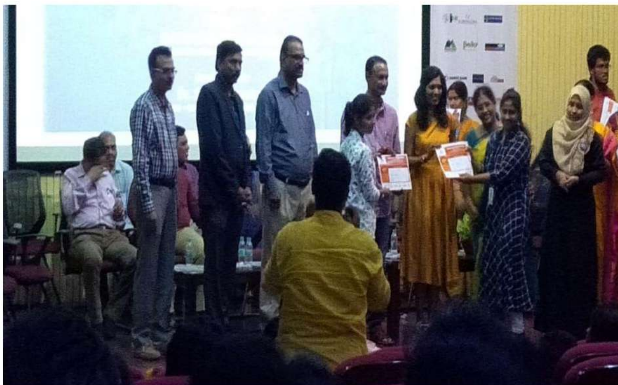
Pharm.D Students receiving best presentation award AY 2018 – 19