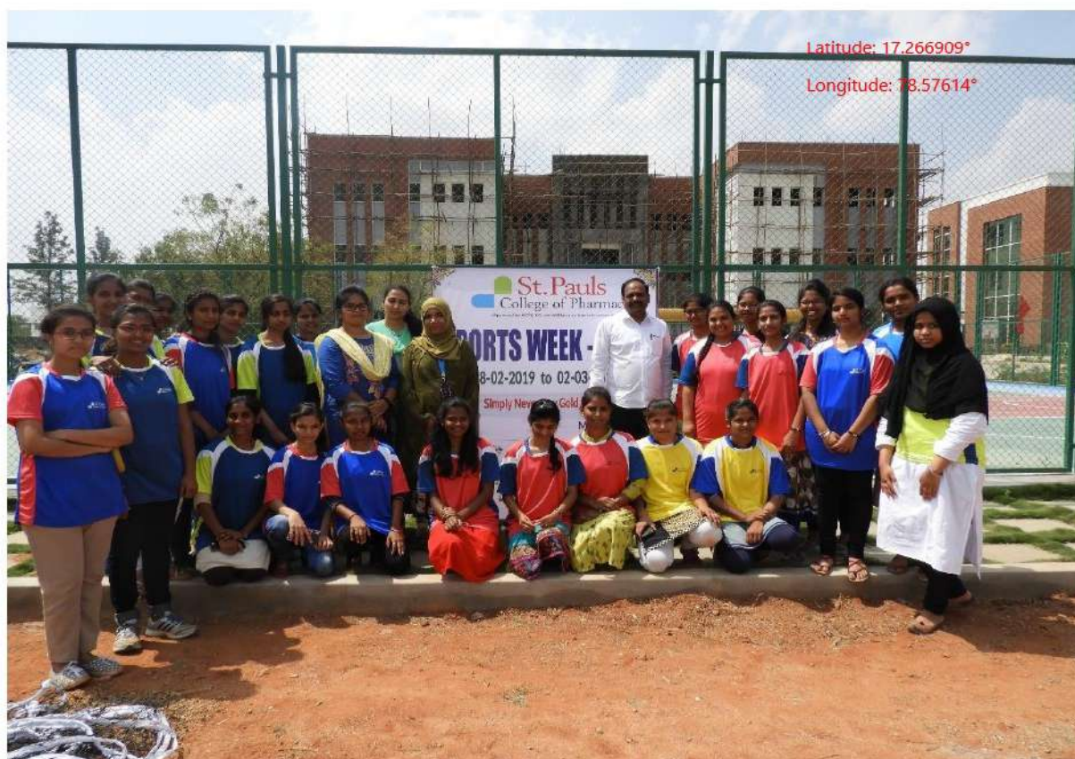
Participants in Intercollege Sports Competitions AY 2018 – 19