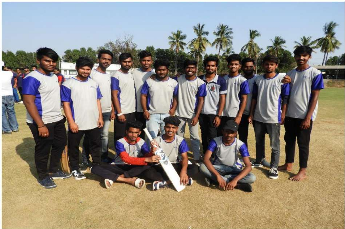
Cricket Winning Team AY 2020 – 21