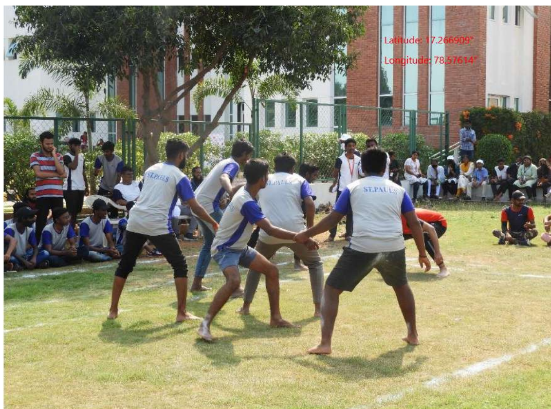
Chess Competition in inter college competition AY 2020 – 21

Latitude: 17.266909° Longitude: 78.57614°