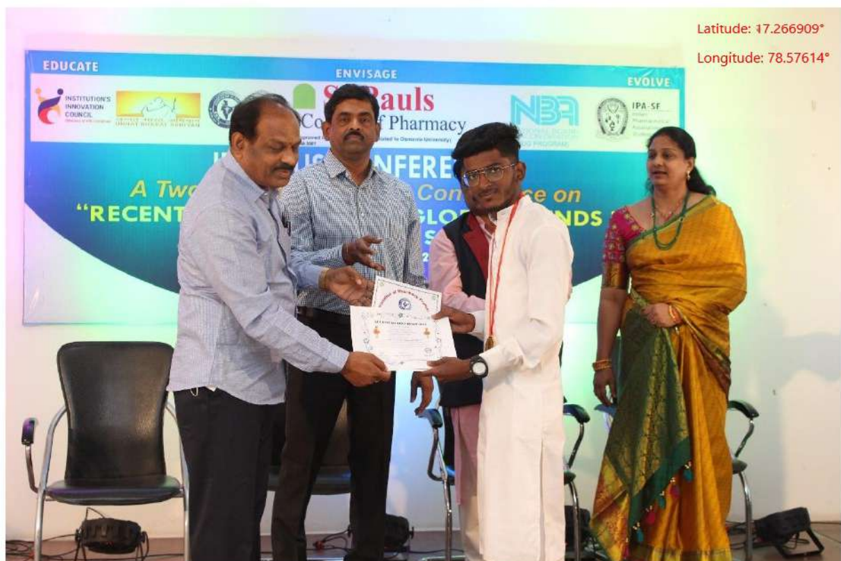
Best Student Award B.Pharmacy AY 2020 – 21