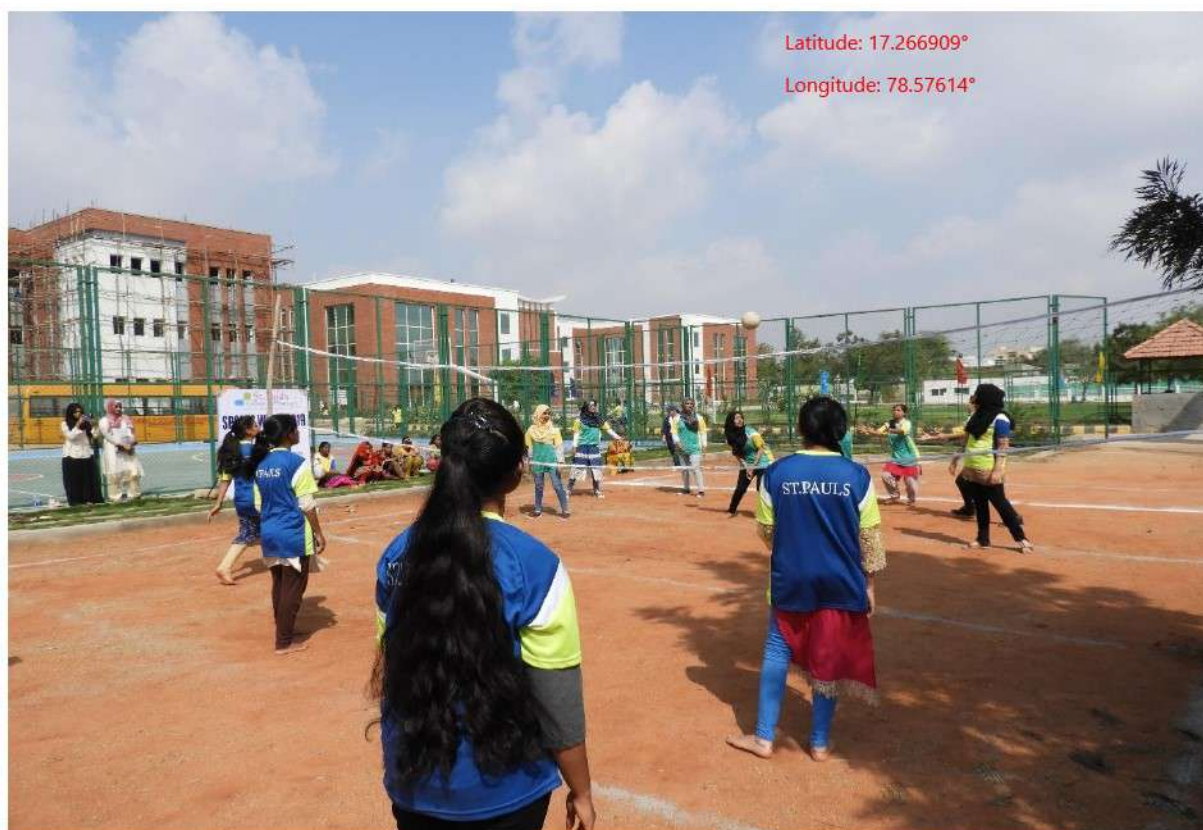
Throwball team in intercollege sports competition 2018 – 19