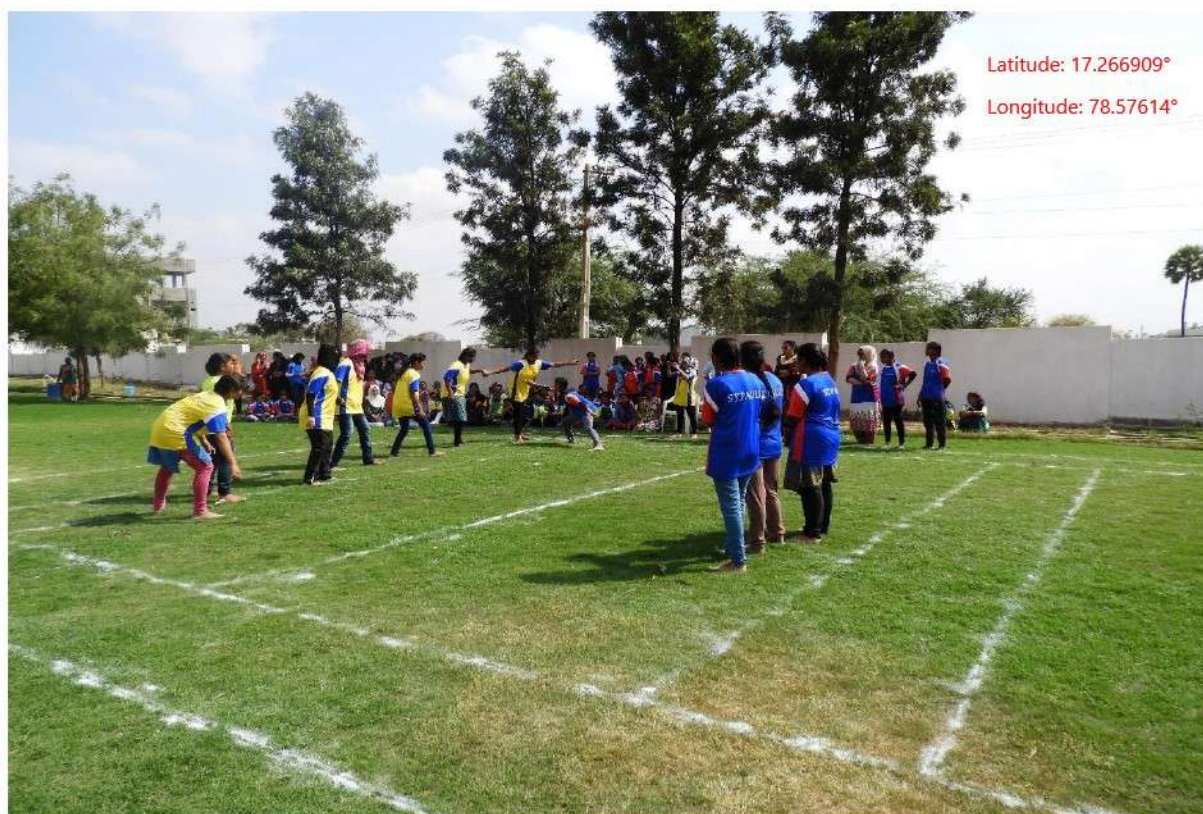
Kabaddi for girls in inter college sports competitions AY 2018 – 19