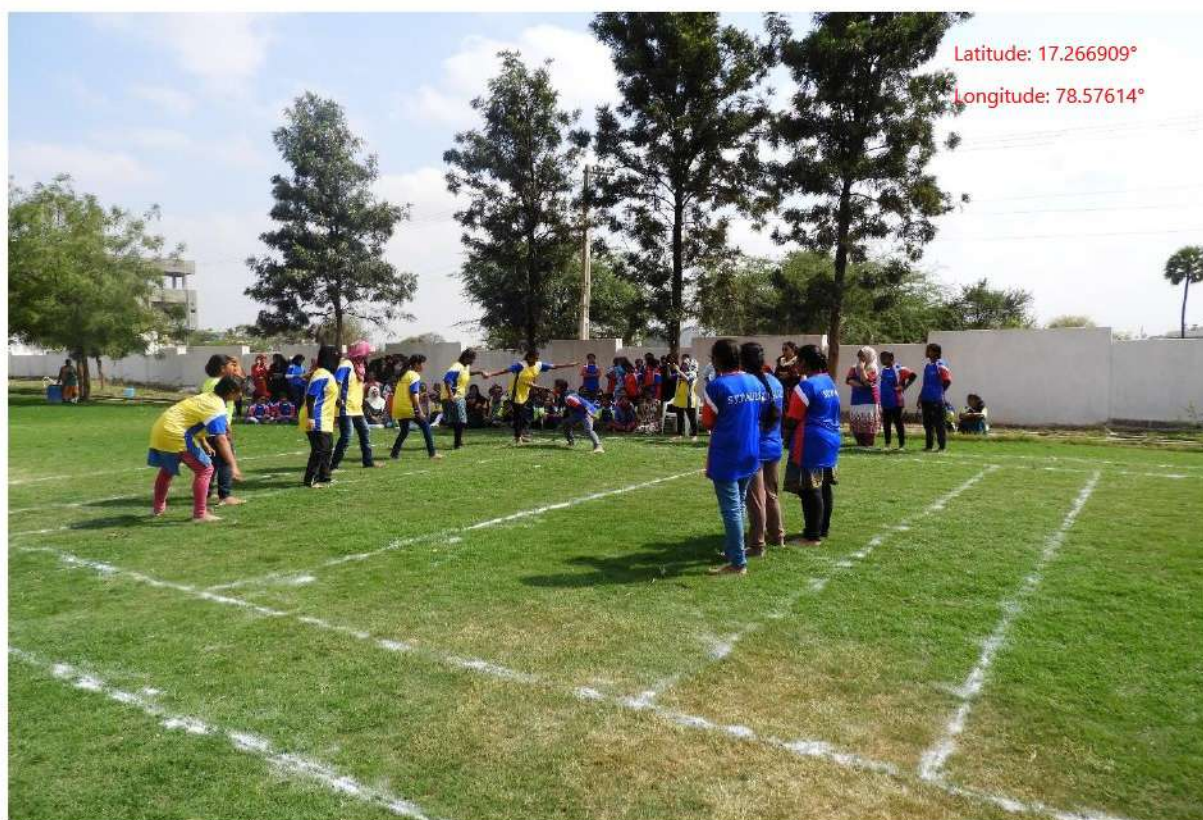
Kabaddi for girls in intercollege Sports Meet AY 2018 - 19