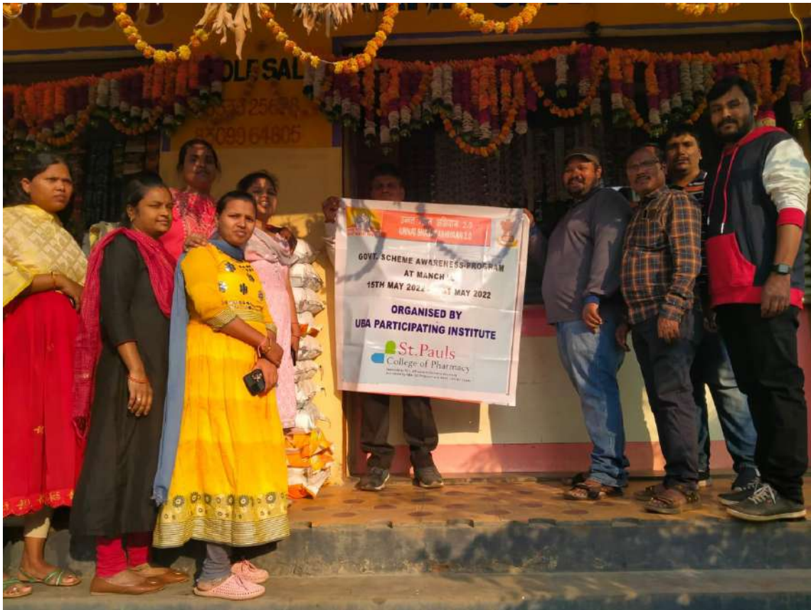
Govt Scheme awareness program at manchal