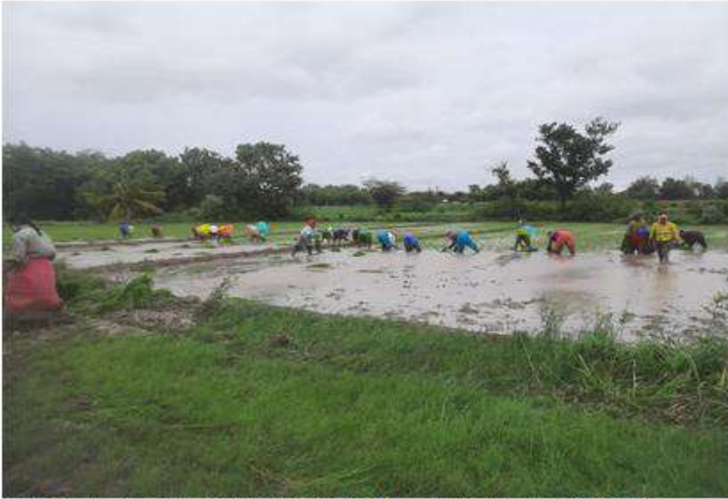
Action plan initiation at Manchal Village, block Manchal, R.R dist, Telangana state- Black rice