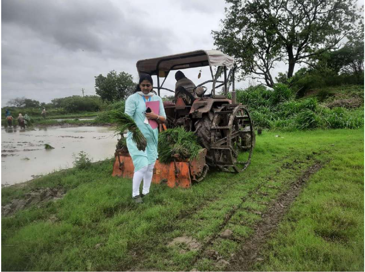
Project investigator working on Transplantation of Black rice plantlets in July 2022 in Manchal village, block Manchal, R.R dist, Telangana state