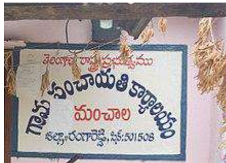
Gram panchayat , Manchal