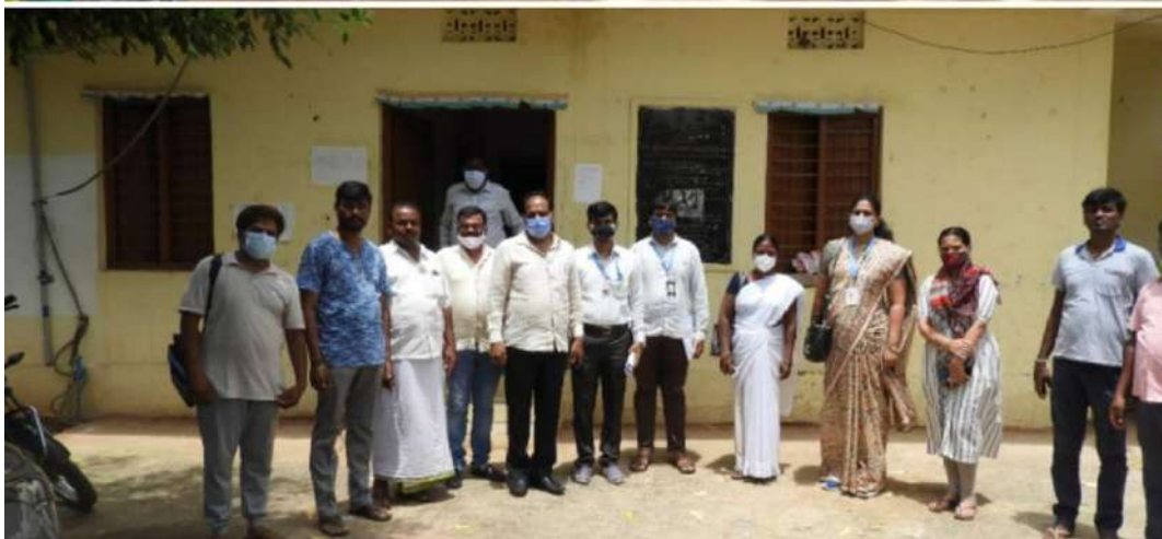
Village level and Gram Panchayat survey in District head quarters of Manchal Gram panchayat, Manchal village about socioeconomic status and health status of villagers