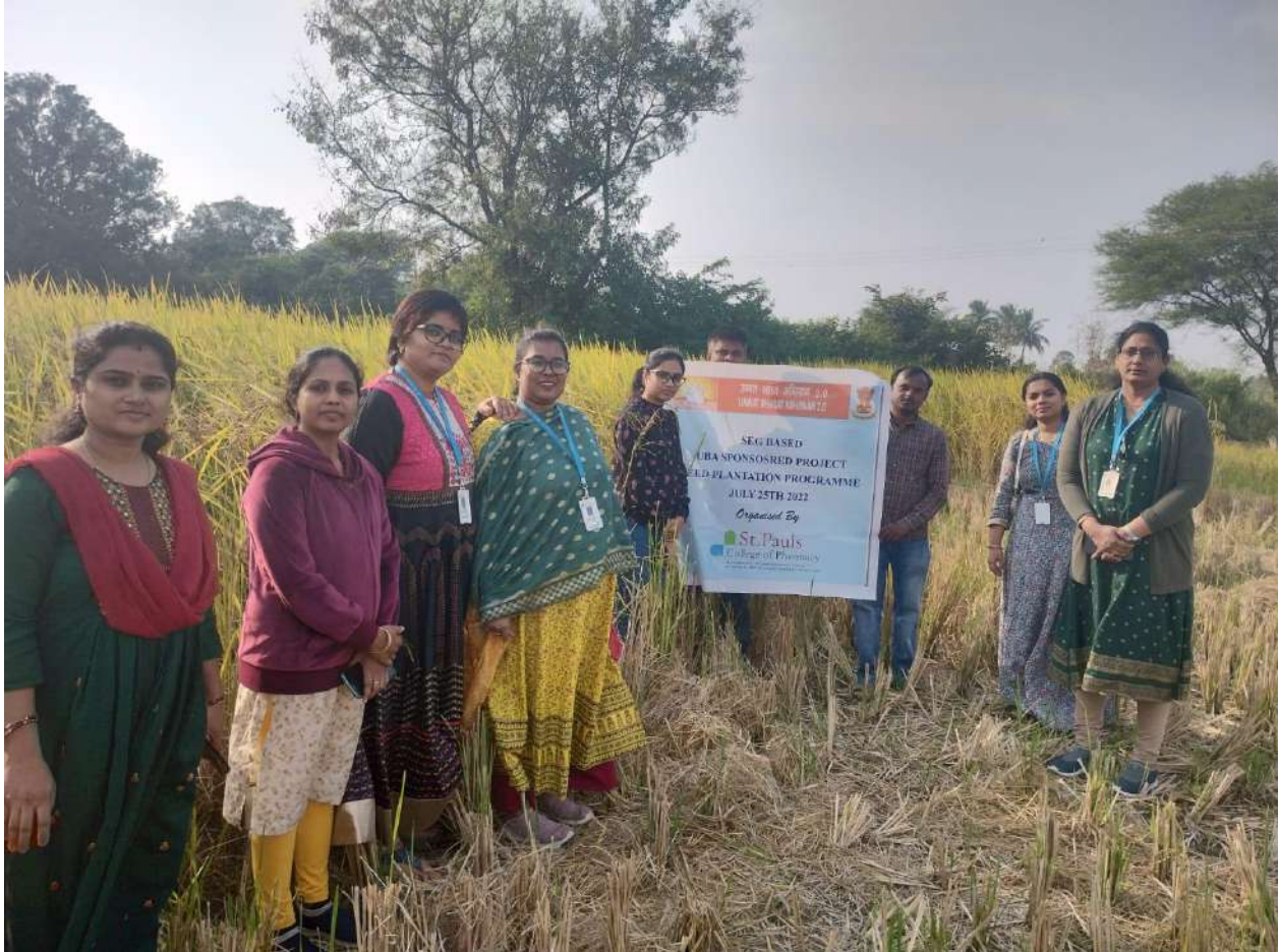
SEED Development Plan on JULY 2022

Seeds were procured and SEED development plan was initiated in July 2022, further the Mid term progress and difficulties faced were monitored time to time in association with Village panchayat secretaries.