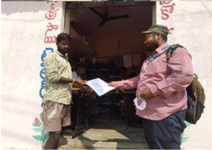
Baseline Survey-Village level survey and House Hold Survey