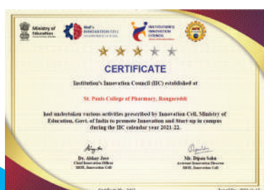
IIC 3 STAR Certificate 2021-22