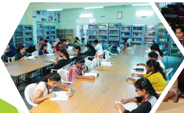
AUTOMATED & DIGITAL LIBRARY