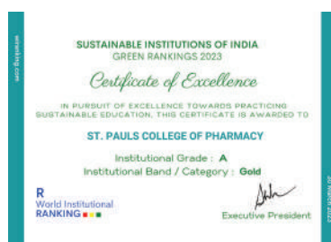
Green Ranking Certificate - 2022