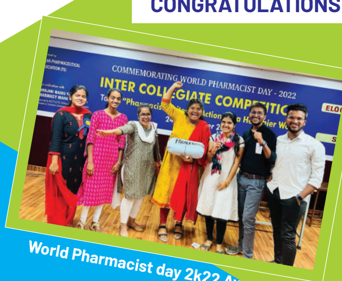
World Pharmacist day 2k22 Awardees