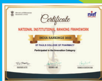
Certificate NIRF Innovation 2023