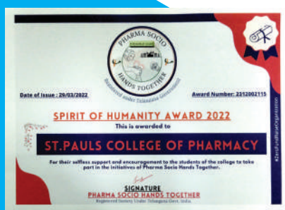
Spirit of Humanity Award-2022