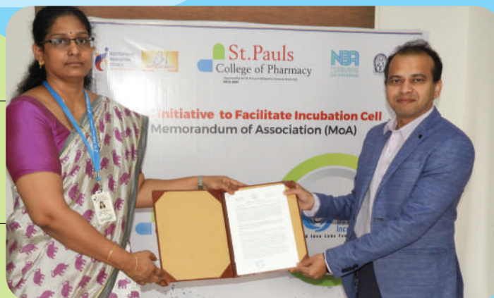
MoU with Osmania Technology & Business Incubator (OTBI)