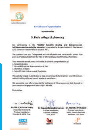
Manav Certificate 2021