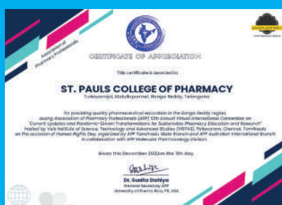
Certificate APP 2022