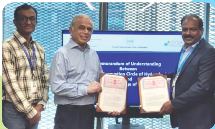
MoU with Research & Innovation Circle of Hyderabad (RICH)