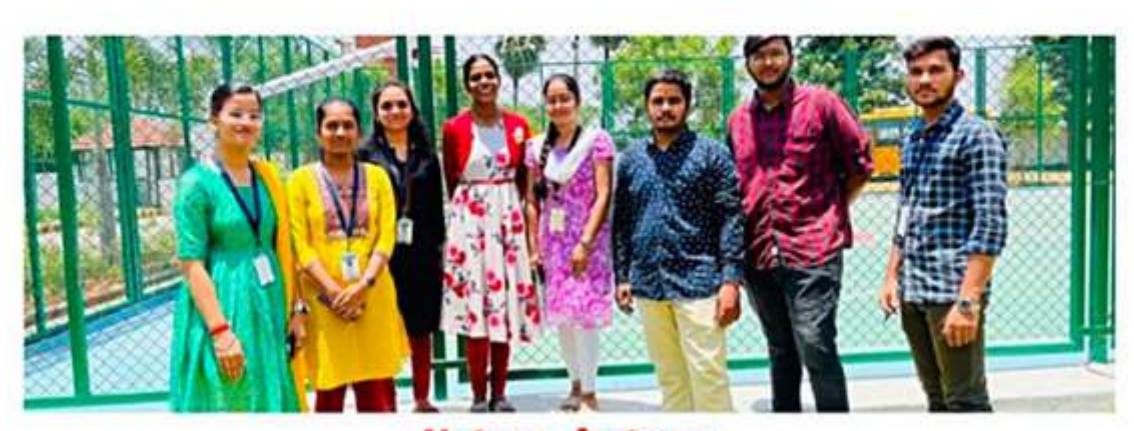
Not me, but you