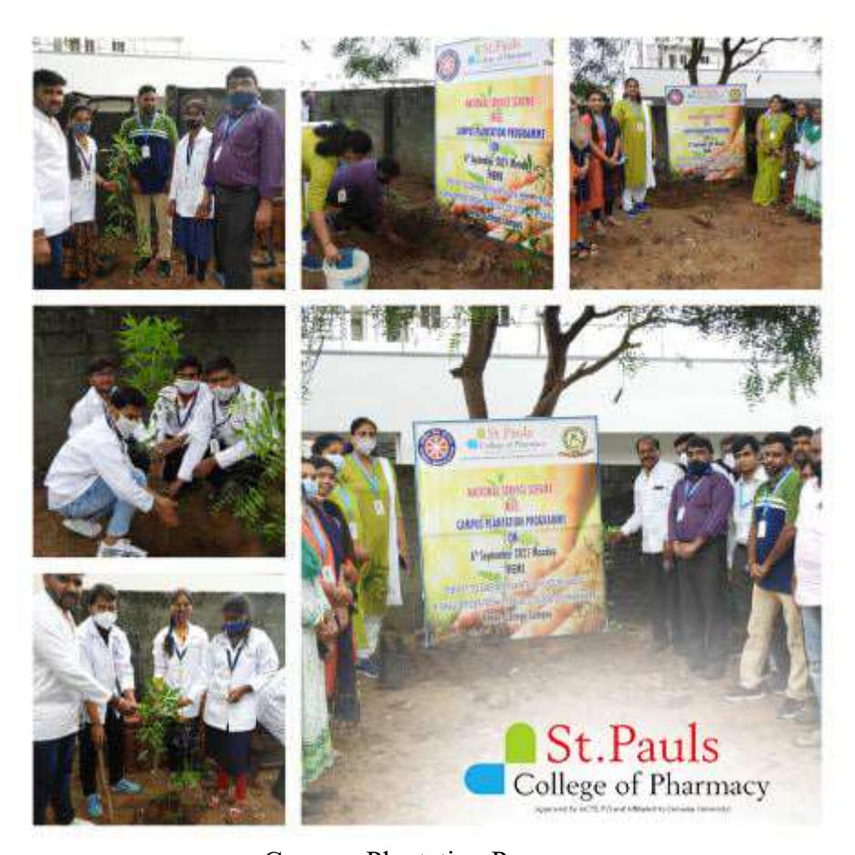
Campus Plantation Program

St. Pauls college planted saplings within the campus as a small effort to contibute to greener world.